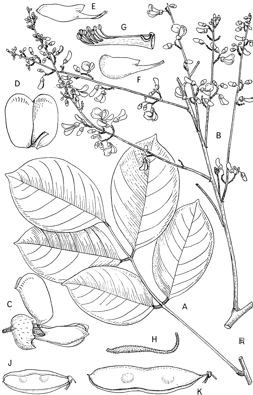
FIG. 3. Derris . A-J, D. rubrocalyx . A, leaf, \times \frac{2}{3} ; B, flowering branch, \times \frac{2}{3} ; C, flower, \times 3 ; D, standard, \times 3 ; E, wing, \times 3 ; F, keel, \times 3 ; G, androecium, \times 3 ; H, gynoecium, \times 3 ; I, stem, \times 3 ; J, fruit, \times \frac{2}{3} ; K, D. submontana . Fruit, \times \frac{2}{3} . A-J, from Schodde 2759; K, from Clemens 8162. Drawn by Miss P. Halliday.